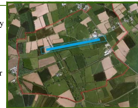
2007 aerial view with airstrip in blue-Col Ray J. Stecker, CO of 365FG, in front of Chateau de Fontenay